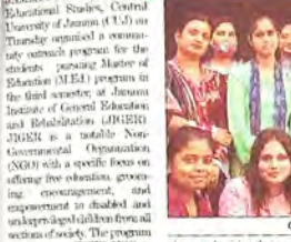
CUJ students and faculty during a programme.