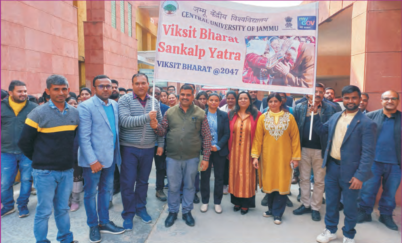
Viksit Bharat Sankalp Yatra was held in the university on 21 December, 2023